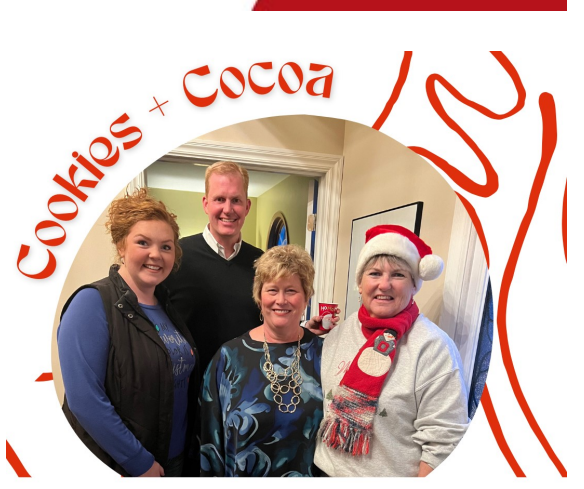
Community Members, Faculty and Staff Gathered at the President's Home to Enjoy Cookies and Hot Cocoa after Giving Tuesday. Click to watch the video!